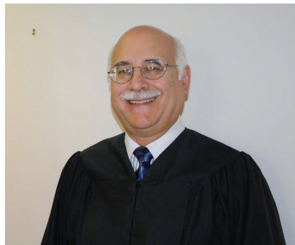
Judge W. McGregor Dixon, Jr.

The Probate Court of Miami County is a division of the Miami County Common Pleas Court. Probate Courts are one of the oldest courts in Ohio, dating back to the Northwest Territory of 1787. The Ohio Constitution of 1851 created a separate Probate jurisdiction in each county.